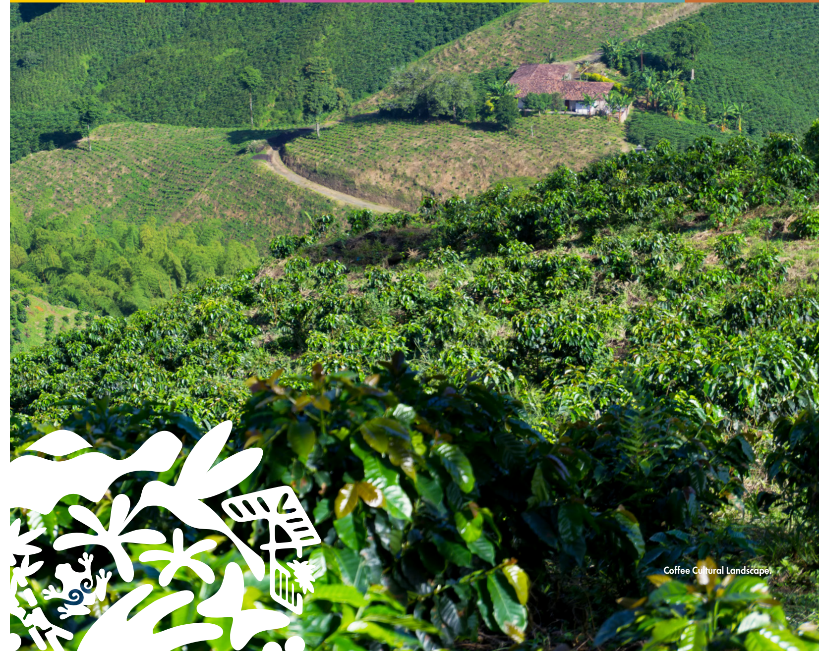
Coffee Cultural Landscape.