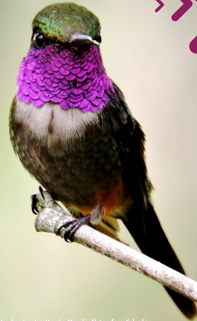
Purple-throated Woodstar.