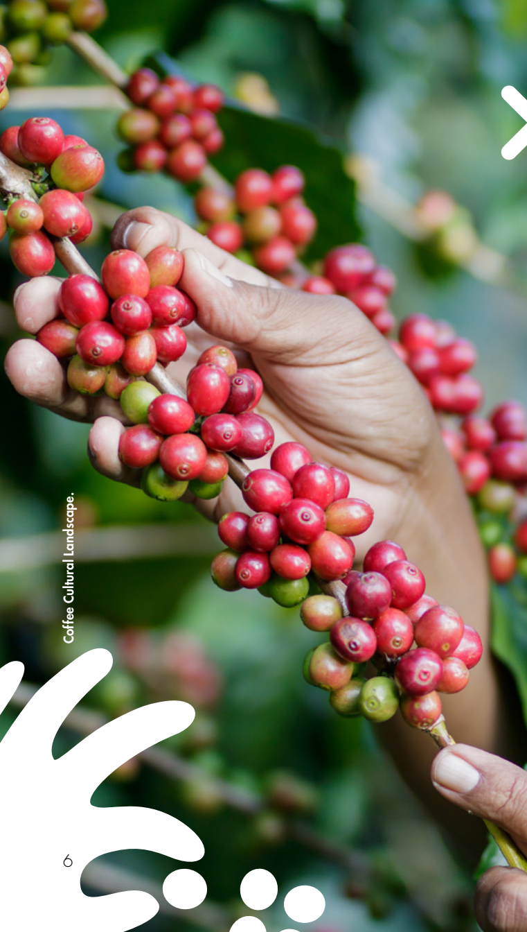
Coffee Cultural Landscape.