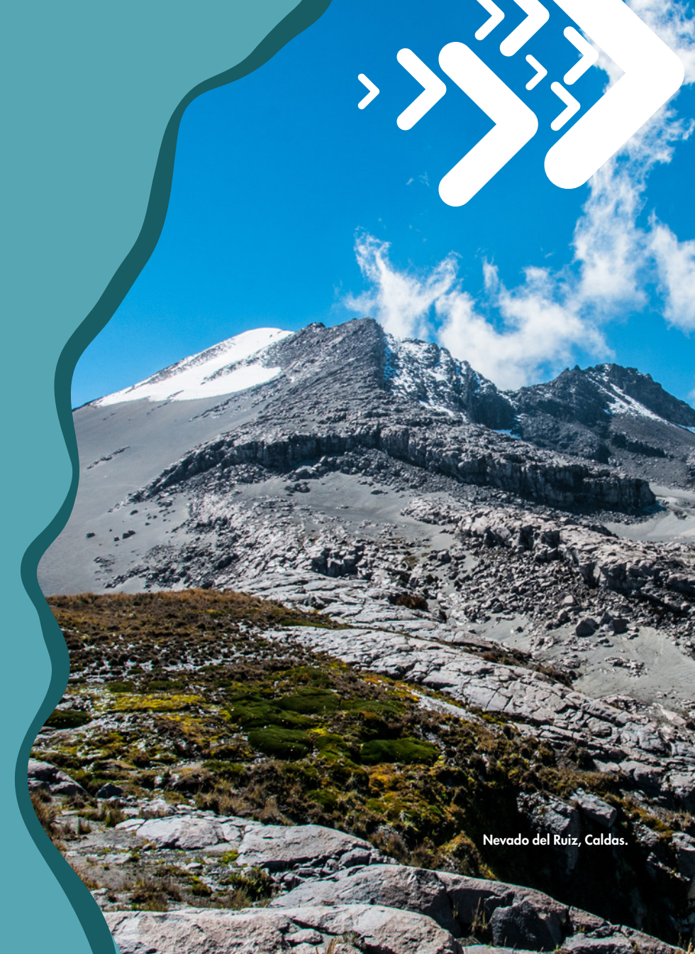
Nevado del Ruiz, Caldas.

Bottled drinks, juices and hot drinks that have been boiled are safe to drink.