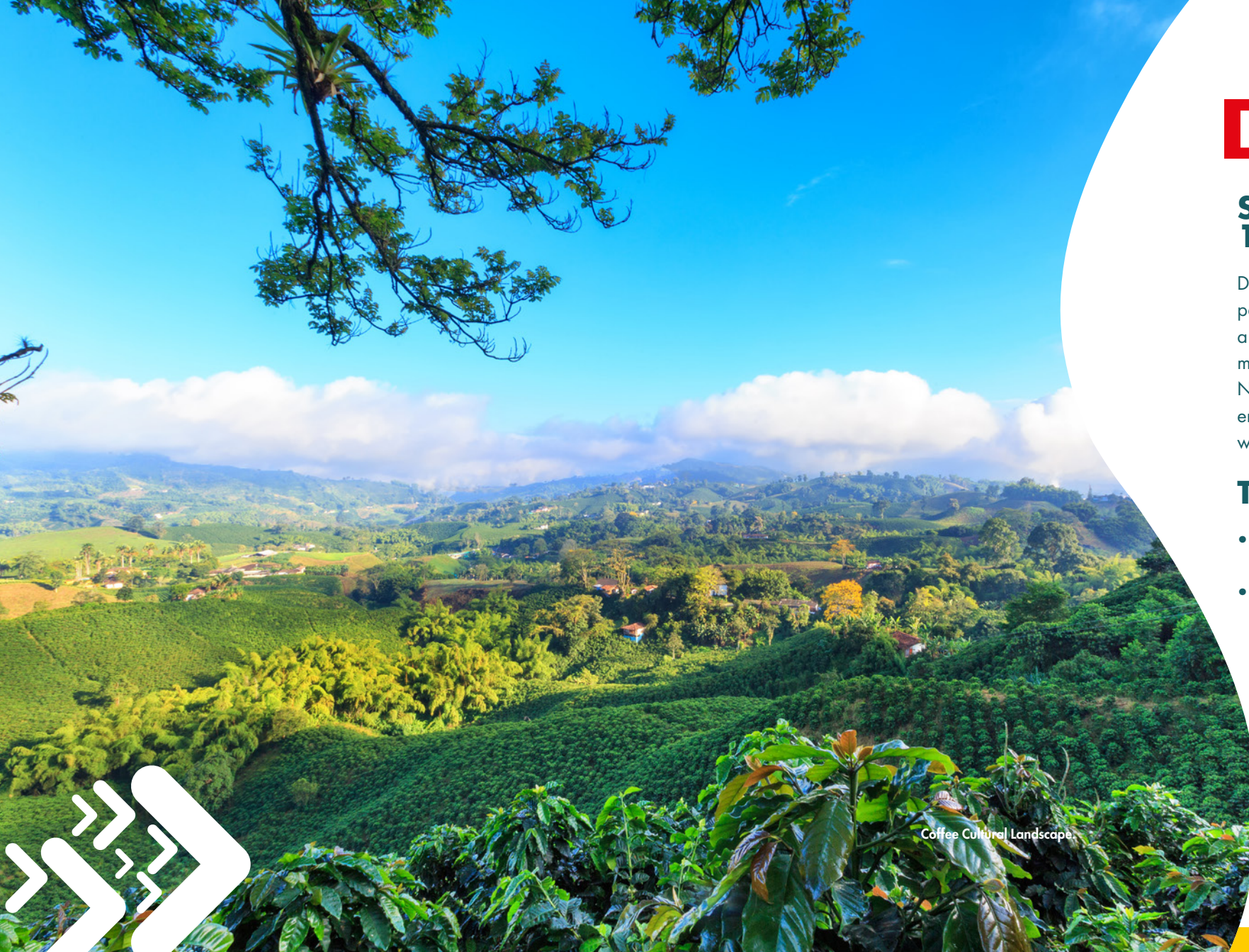
Coffee Cultural Landscape